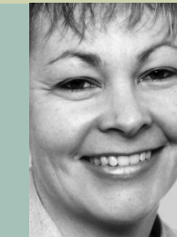
Dr Caroline Lucas MEP , leading candidate in South East England and Principal Speaker of the Green Party of England & Wales.

PUBLIC ACCOUNTABILITY AND ACTIVE CITIZENSHIP – defence budgets, military decisions and war declarations publicly debated in advance. Moves towards greater secrecy in Europe over security decisions must be strongly resisted.