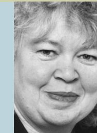
Jean Lambert MEP , leading Green candidate for London, European Parliament Green/EFA Group spokesperson on Asylum and Migration, Deputy Member of the European Parliament’s Civil Liberties Committee.

Europe is home to a much lower proportion of the world’s refugees than either Asia or Africa. Europe hosts 18.3% of the world’s refugees – Asia hosts 48.3% and Africa hosts 27.5%. Nearly half the world’s refugees come from either Palestine or Afghanistan – both areas of major conflict. Refugees account for 0.29% of the UK’s total population – a significantly lower proportion than in Sweden, Germany, the Netherlands or Austria.