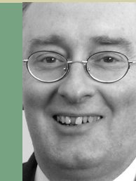
Martyn Shrewsbury , leading Green candidate in Wales, and Leader of Wales Green Party/Plaid Werdd Cymru.

“Under Labour, a typical British taxpayer pays £134 in agricultural subsidies every year. From these subsidies, seven of Britain’s richest landowners get