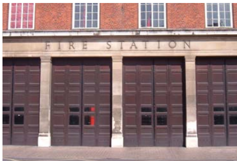
Photo: The Fire Station in Norwich city centre.